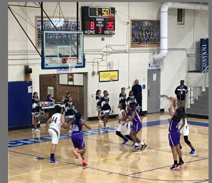
Our Marshall Girls' Basketball team in action against Antioch Middle