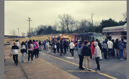
Students enjoy food trucks at Winter Bash