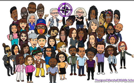
WE ARE MARSHALL & WE ARE DESTINED FOR GREATNESS! Thurgood Marshall Middle School 5832 Pettus Road, Antioch, TN 37013 615-941-7515

Say hello to our Marshall Bitmoji Faculty! Can you see your teachers in this picture?