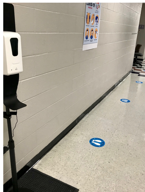
TMMS getting ready for the return of more students. Keep those hands clean and stay 6 feet apart!