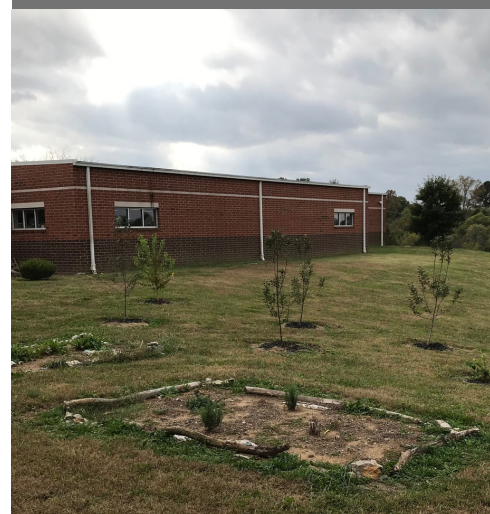
Our new garden and apple trees are beginning to grow at the back of our school. A green house will be coming soon!