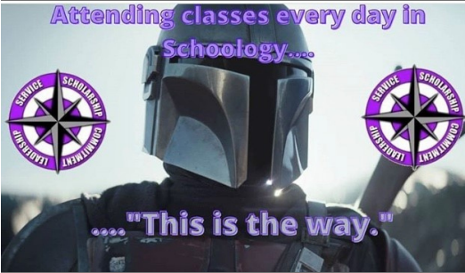
Log in and attend classes every day! It is the way!