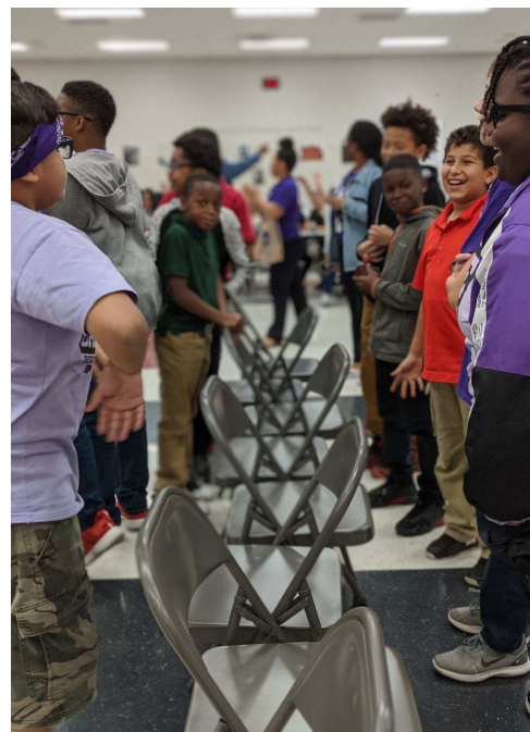
Students participate in musical chairs in the cafeteria last year