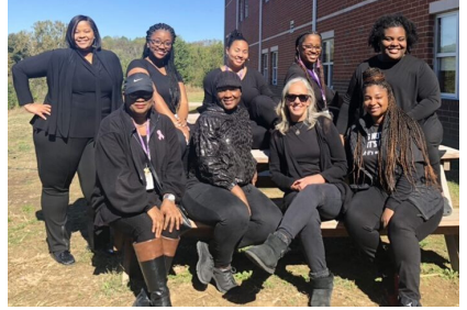
6th grade team trying to find some shade