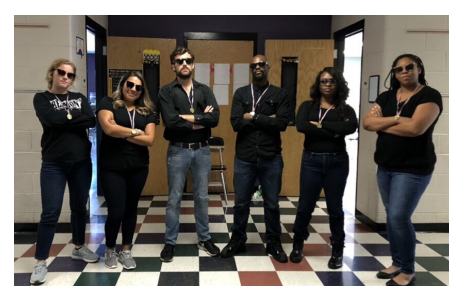
8th grade team playing it cool with shades!

Also, please pick up your child by 4:15 pm. At 4:30 pm the office closes, and starting on Monday 11/25, parents will need to come into the gym (via cafe door) to sign out their child if they arrive later than 4:30 pm.