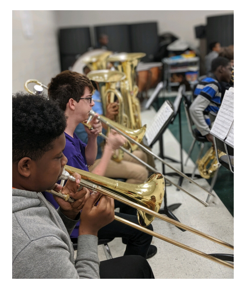
Wind Ensemble students play during lunch periods