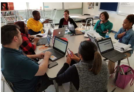
5th Grade Team engaged in text based planning

Also, please pick up your child by 4:15 pm. At 4:30 pm the office closes, and starting on Monday 11/25, parents will need to come into the gym (via cafe door) to sign out their child if they arrive later than 4:30 pm.