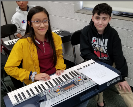
Students learn to play piano during Enrichment