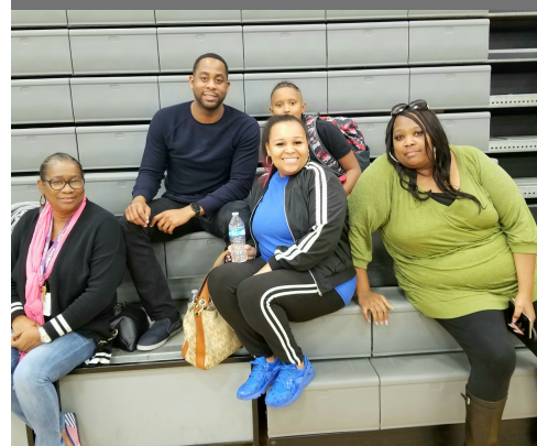
Marshall staff hang out at last year's basketball game to show their support for our team