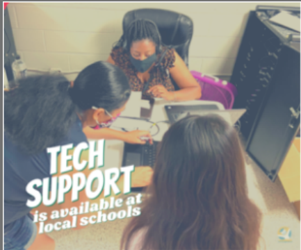
In-person tech support @ Glencliff High School at back of building off Holbrook drive by Tennis Courts