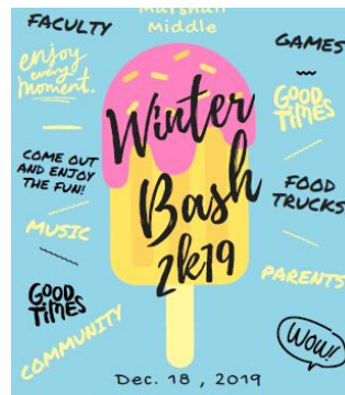
Students enjoy Winter Bash incentive this Wednesday during Career Arts!

Again, all students with no discipline referrals/behavior infractions will be allowed to attend. We want to thank all of our students who continue to demonstrate the four P's (Positive, Productive, Punctual, & Polite) on a daily basis. Keep up the great work!.