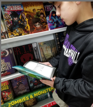
Thank you for your support of the Book Fair!