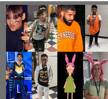
Students and Staff Participate in Celebrity Status Wednesday!