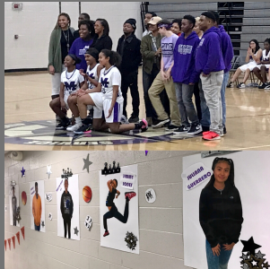
8th graders recognized at center court & hall