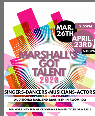
Get ready for Marshall's Got Talent!