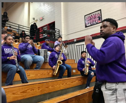
Pep Band fires up the team and the crowd

Both teams won their first game and lost their second game in the tournament. However, both teams finished strong, won the third game, and brought home the 3rd place trophy. We want to thank our staff, parents, and students for your support all year. We are extremely proud of our players and their coaches for a great season!