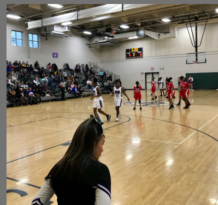
Our girls' team brings home another victory!