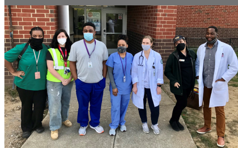
Staff celebrates 1st responders