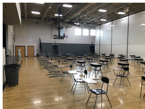
Marshall staff was ready for our Virtual students to join us at the school for testing