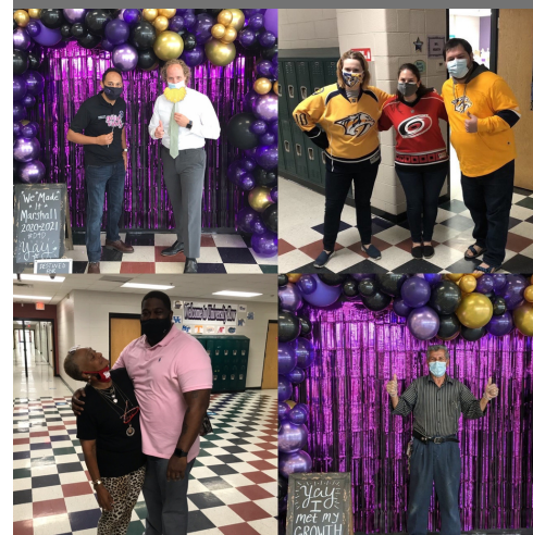
TMMS Staff take the opportunity to take photos with co-workers and family!