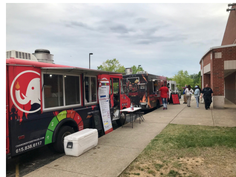
The 8th grade team had food trucks for students and staff last week to celebrate the end of the year.