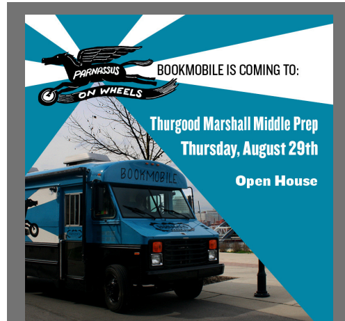
Come shop for books at Open House!