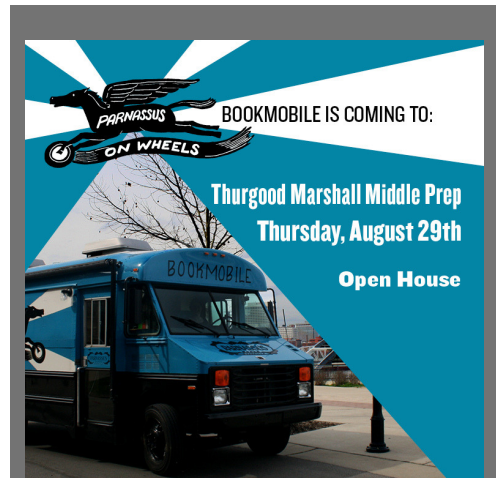
Come shop for books at Open House!