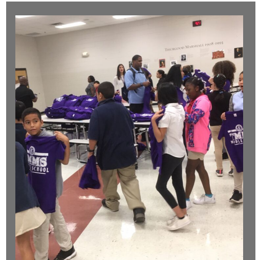
Students pick up 2019-2020 Marshall shirts while staff assist

Did you know that all Marshall students have access to the online program IXL for Math and Science? Please ask your child and/or the Science and Math teacher for the IXL login. With this information, you can monitor your child's usage and have them practice concepts they are working on at school.