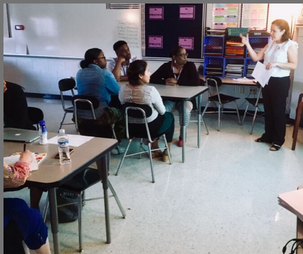
Ms. Owen leads student data talk training