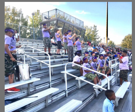
Pep Band plays new TMMS fight song in celebration of touchdown