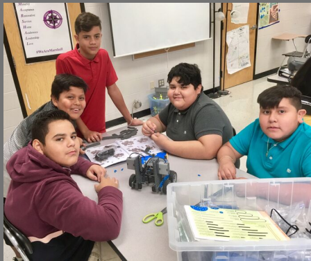
Marshall boys build robots in STEM class